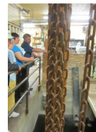
Behind the Scenes Water Treatment