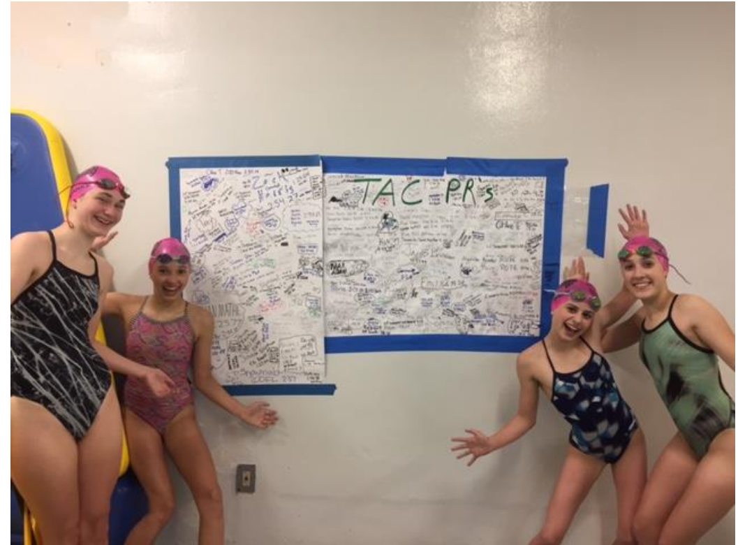
TAC swimmers make a personal record at the annual Thunderbird swim meet.